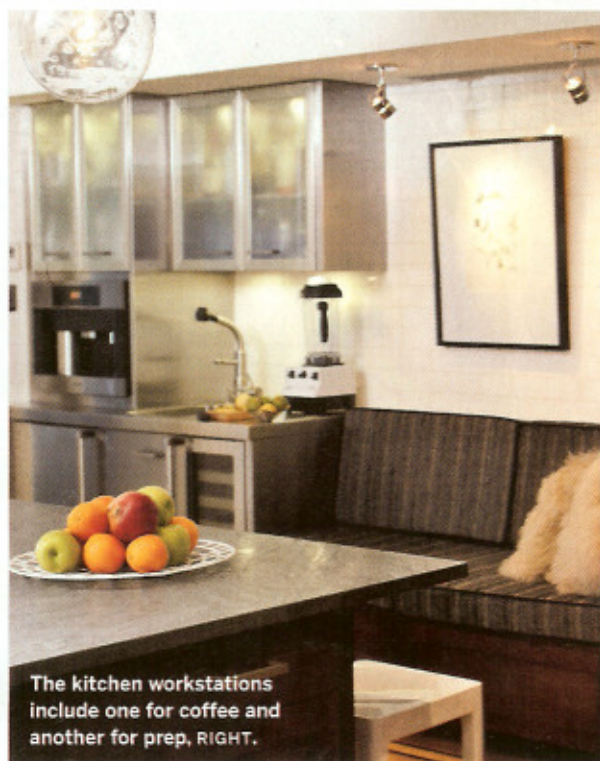
The kitchen workstations include one for coffee and another for prep, RIGHT.